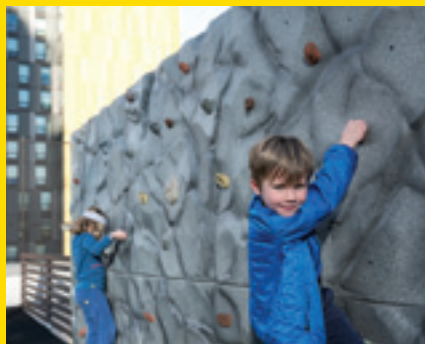
New climbing wall