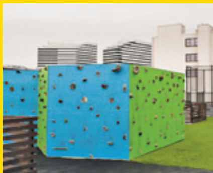
Old climbing wall

My whole-hearted thanks to the Spruce Street School families: past, present and future. You built and continue to build this school community through your passion and commitment.